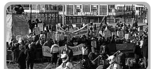
'Stuff' (among other things) the Monarchy was the chant.

In direct democracy the system of exploitation through wage-slavery could be abolished with production controlled & redefined by federated communities on the basis of need not greed in total empathy with the environment. Without the need for the likes of queens, senedd or armies of cops!