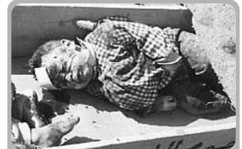
One of the minimum 30,000 killed in Iraq since 2003 an end user of BAe products.

As well as reaching out to children locally, BAe train some of the world's deadliest killers just down the road from Glascoed in Cwmbran. Since January 2000 1600 student from 40 countries have been taught at 'BAe Systems Cwmbran Training College' (formerly Dundry College).