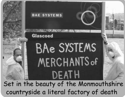
Set in the beauty of the Monmouthshire countryside a literal factory of death

BAe Systems is Europe's biggest arms company & it's growing all the time. Glascoed near Usk is home to a former Royal Ordnance factory taken over by BAe Systems in 1987. The main activity of the 400 employees at 'Land Systems Munitions & Ordnance Glascoed' is the filling, packing, & supplying of finished munitions including tank shells, mortar shells, small arms ammunition, missile & torpedo warheads, (including Hellfire missiles), depth charges & warheads.