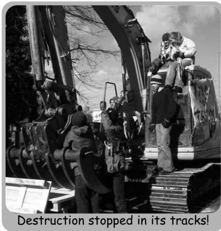
Destruction stopped in its tracks!

staged a tree top protest against the new superstore building. The protest was taken to the high court in London & evicted a week later. A fence was erected around the site covered in anti-climb paint. Tesco were in such a rush to hide their destruction, they forgot to put a perimeter around a group of Scots pine trees, these were promptly re-occupied. The site has amazing defences against the eviction, including tree houses, walk ways between trees & lock ons. Work has been stopped on several occasions. For anyone wanting to go support the protest Shepton Mallet is on the A361 between Glastonbury & Frome. Nearest train stations are Castle Cary or Frome. The camp is behind the Cenotaph (at the top of the High Street) at the south end of Townsend Road.