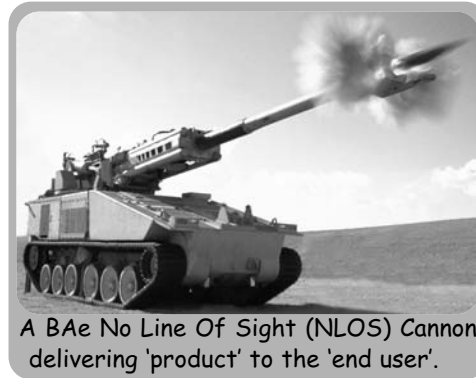
A BAe No Line Of Sight (NLOS) Cannon delivering 'product' to the 'end user'.

We are informed that learning about war means that the children can try on gas masks & "learn about about what life was like". We doubt if they will be shown the carnage, slaughter & the real effects of war, about how armament companies profit from war by selling weapons to anyone who wants them regardless of the consequences. Nor told that BAe Systems build & supply armaments like cluster bombs & in the past, depleted uranium