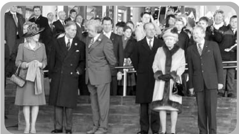
You are not needed, you are not wanted, you will be first up against the wall!

Despite the media spin of a "warm Welsh welcome" the Queen coming to open the new Assembly building in Cardiff Bay on March 1st was met with 200-plus anti-monarchist protesters to let the Queen know she wasn't at all welcome. A heavy police presence, including the Metropolitan Police Forward Intelligence Team, kept a close eye on protesters, who far outnumbered Royalist supporters, if you don't include the school kids that were bussed in, told to wave a flag & cheer on queenie. An anarchist presence made the point that both the Royals & Government representatives are not needed & not wanted, neither being capable of representing us. The Royal Family cost £37million to the taxpayer in 2004. That figure excludes security costs, which must be alot judging by the number of coppers, snipers & undercover goons in attendance. Though the crown still has some special