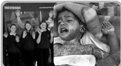
From Rumney to Bagdad children put their hands up for BAe.

The hypocrisy is obvious - a producer of weapons of mass destruction that maim & kill thousands of men, women & children throughout the world for profit inviting