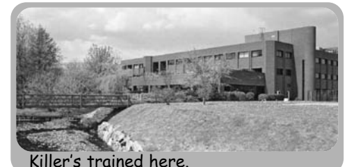
Killer's trained here.

Why not apply for a course yourself! BAe Systems Cwmbran Training College, Beacon House, William Brown Close, Llantarnam Park, Cwmbran, NP44 3AB Tel: 01633 835123 Fax: 01633 835033